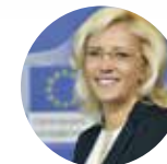
Corina Crețu European Commissioner for Regional Policy

I wish you an interesting and fruitful conference.