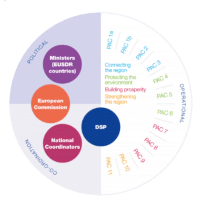
Picture 1: The governance of the EUSDR

c) The revision process started in May 2018. The main steps and the timeline are set out in Annex 1. The EUSDR Communication (COM 2010a) remains untouched. This means that the principles laid down in the Communication remain entirely valid, including the EUSDR governance and the structure with four Pillars and twelve Priority Areas (see pictures 1 and 2). Still, the Action Plan is considered as a "rolling document", which means that the Danube countries should remain attentive if there is a need for adaption.